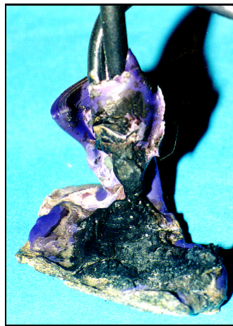
TOGETHER BY THE MELTED IT HAD PROBABLY IGNITED.