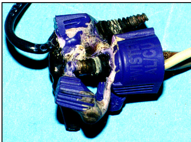
PLASTIC SHELLS SHELL MELTED AND CHARRED. THE CHARRING INDICATES THAT