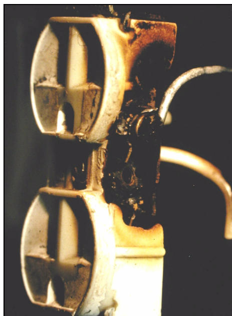
FIGURE 2 - EXAMPLE OF OVERHEATING OF ALUMINUM-WIRED TERMINALS ON A RECEPTACLE. Enough heat was generated by current flowing through the aluminum wire connections to cause charring of the receptacle body and disintegration of the insulation that was on the wire. Note that the face of the receptacle, as the homeowner or an inspector would have seen it, with the cover plate on, would look normal.