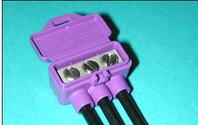
FIGURE 4 - King Innovation "AlumiConn" Connector

In mid-2006 a new connector became widely available for the aluminum wire pigtail application. This connector is shown in Figure 4. An initial set of tests on this connector has been completed. (These test results will be presented, published, and made publicly available in September, 2007.[13]